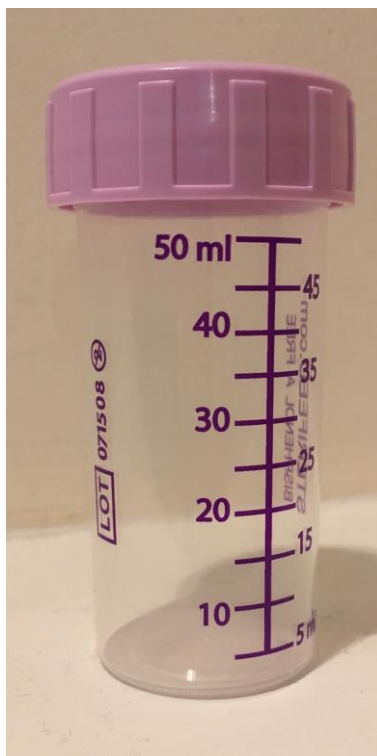
Image of a donor milk bottle

Sick or premature babies benefit from even the smallest quantities of breast milk. Each mother produces different amounts at different times. You will find the amount you express will vary from day to day. Mothers are asked to donate if possible, a minimum of 40 x50ml bottles. This may be collected over a number of weeks/months or you may find you regularly request further bottles to fill.