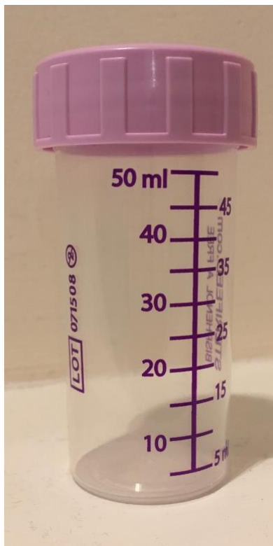
Image of a donor milk bottle

Sick or premature babies benefit from even the smallest quantities of breast milk. Each mother produces different amounts at different times. You will find the amount you express will vary from day to day. Mothers are asked to donate if possible, a minimum of 40 x 50ml bottles. This may be collected over a number of weeks/months or you may find you regularly request further bottles to fill